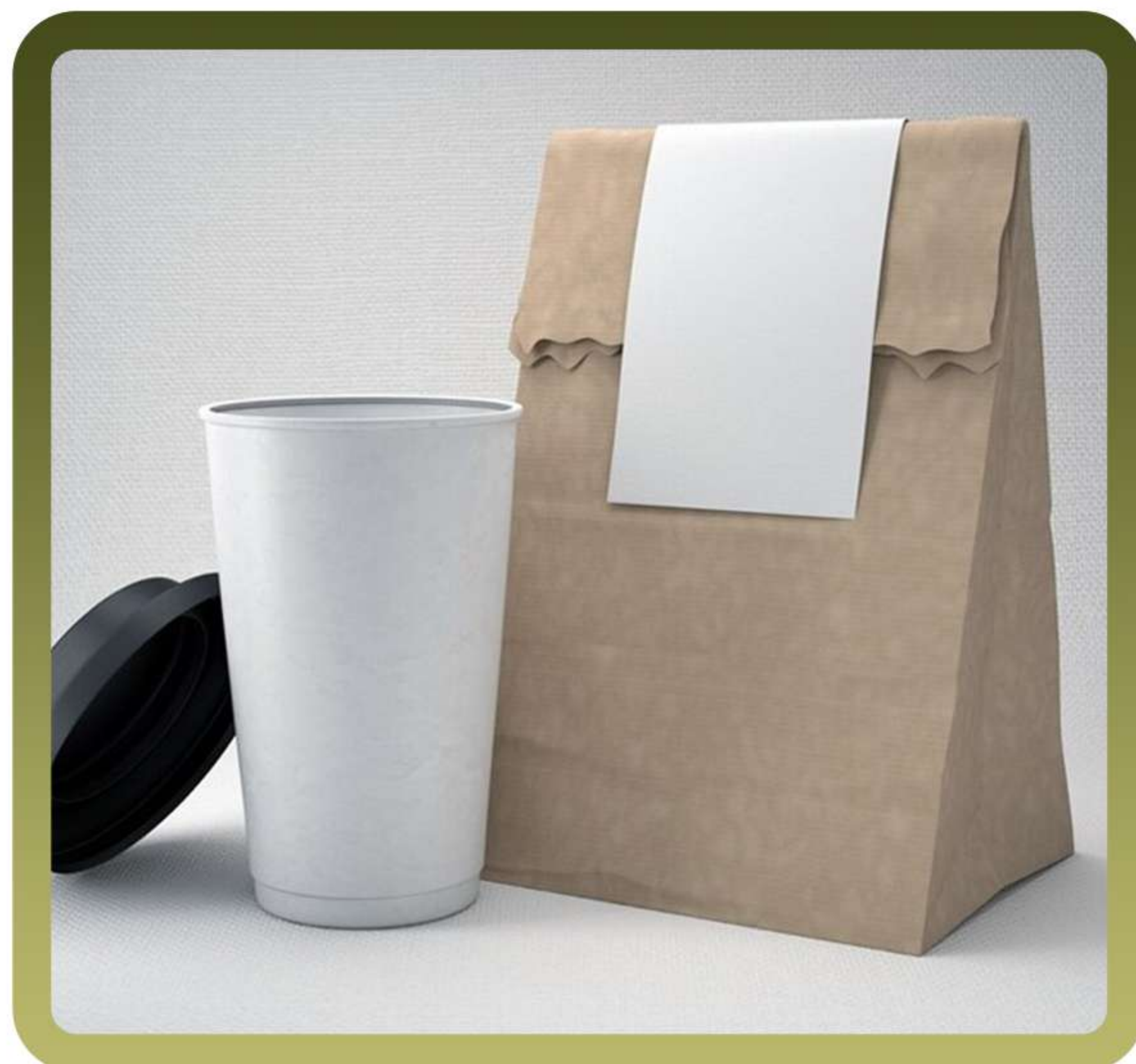
PAPER & PACKAGING