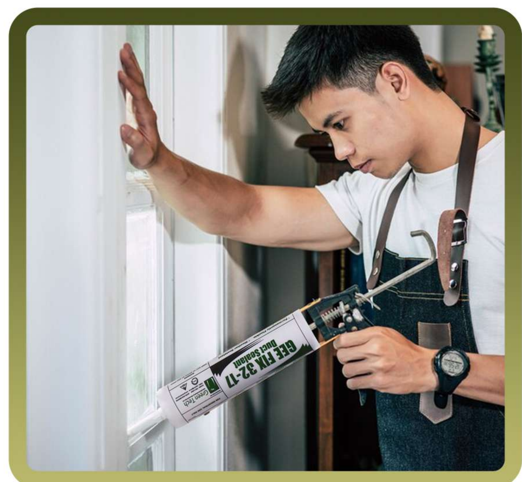
OUR TRADING DIVISION